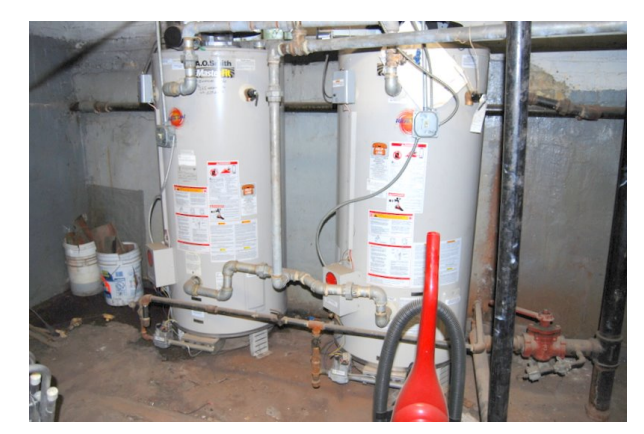
Hot Water Heaters