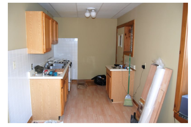
A Kitchen Under Renovation