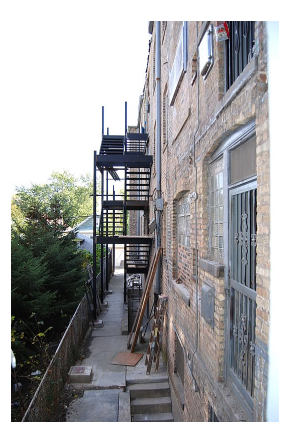
New Porches Under Construction