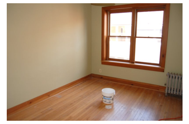
A Refinished Living Room